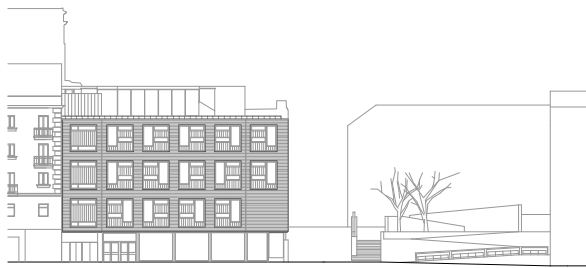
ALZADO A C/ TRIBULETE