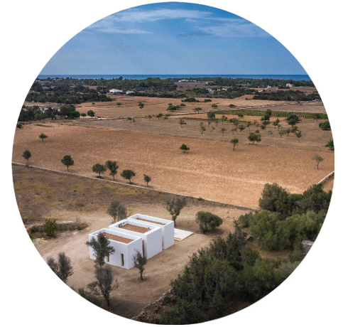
Location of the house along existing dry stone walls